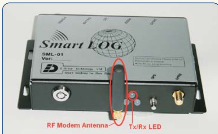
EDT's Smart Log (GPS based AVL device) is equipped with a RF Modem which detects the ID of the Trailer's add-on module

EDT announces the release of its innovative non-powered Trailer Tracking device (the TrailerTracker). This is the first time Trailer Tracking is done using an add-on module to an existing, GPS-based, Vehicle Tracking device and not as a stand-alone Trailer Tracking solution. As such, end-user price is far below any stand-alone GPS-based unit. The add-on module is interfaced with EDT's SmartLog - Online GPS-based, AVL and Mobile Productivity tool. Using the end-to-end hardware & software suite, composed of EDT's SmartLog, TrailerTracker and WebFleetLog, fleet managers may now benefit from an ultimate, online, fleet and trailer tracing & management solution